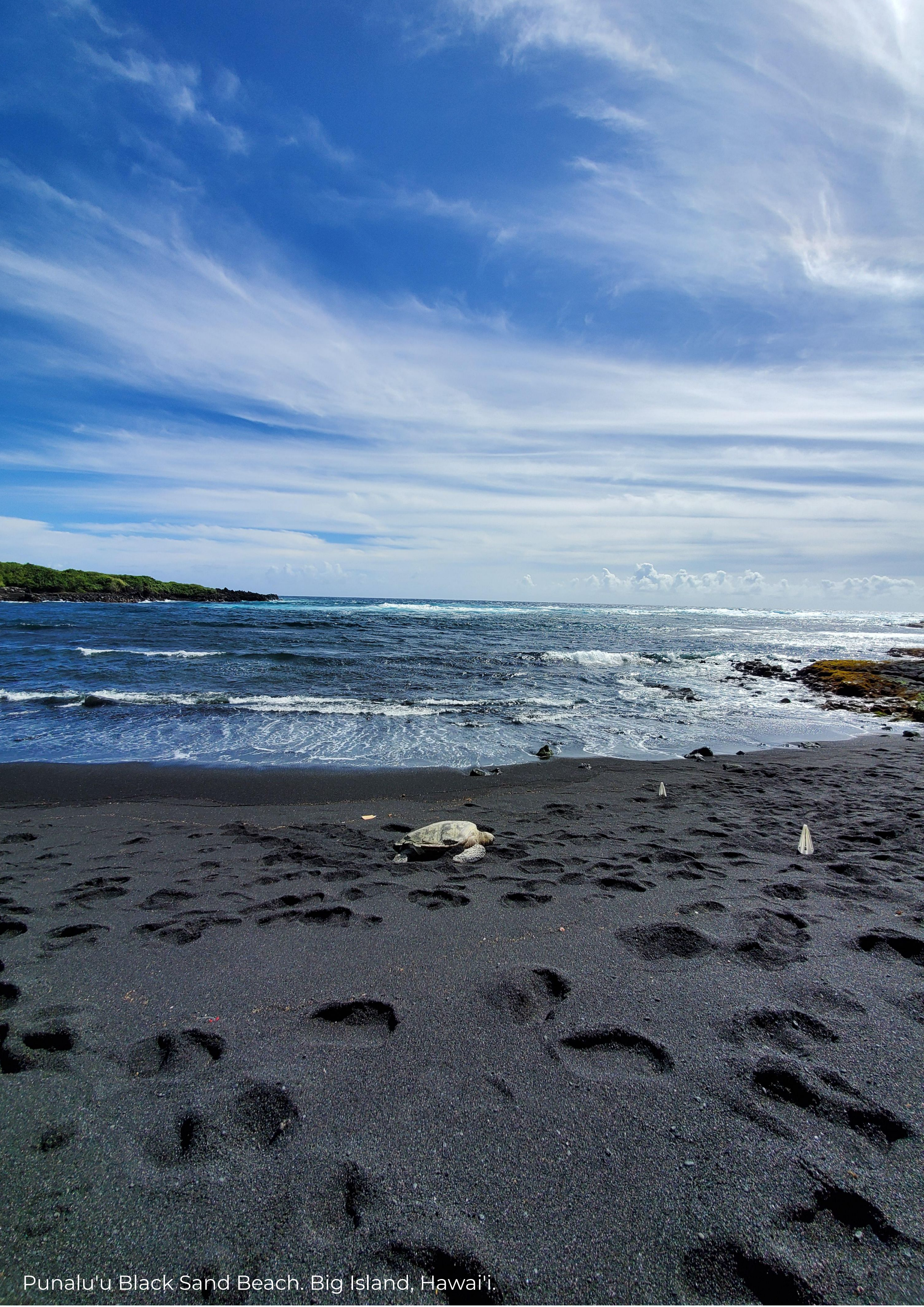
Punalu'u Black Sand Beach. Big Island, Hawai'i.