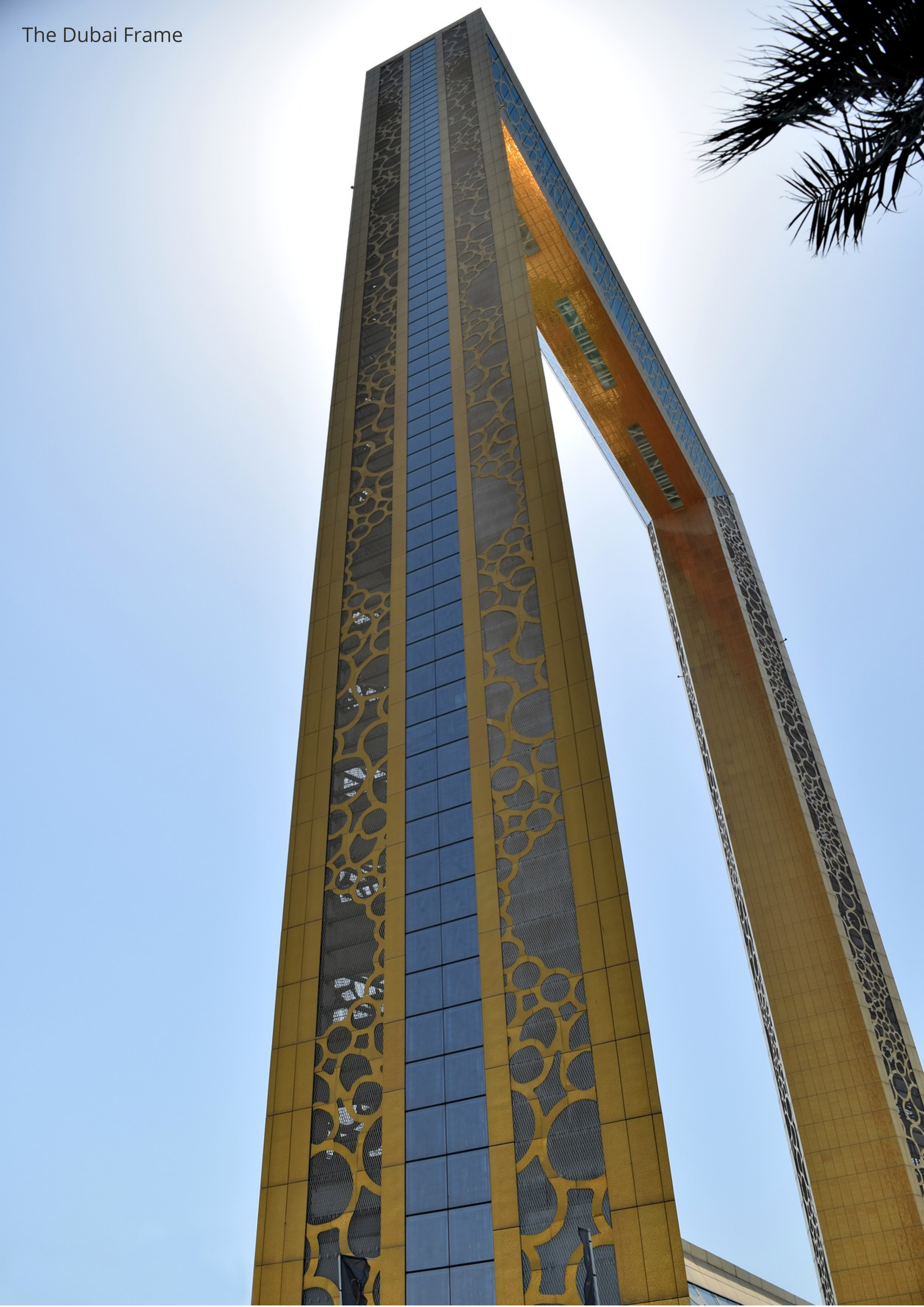
The Dubai Frame