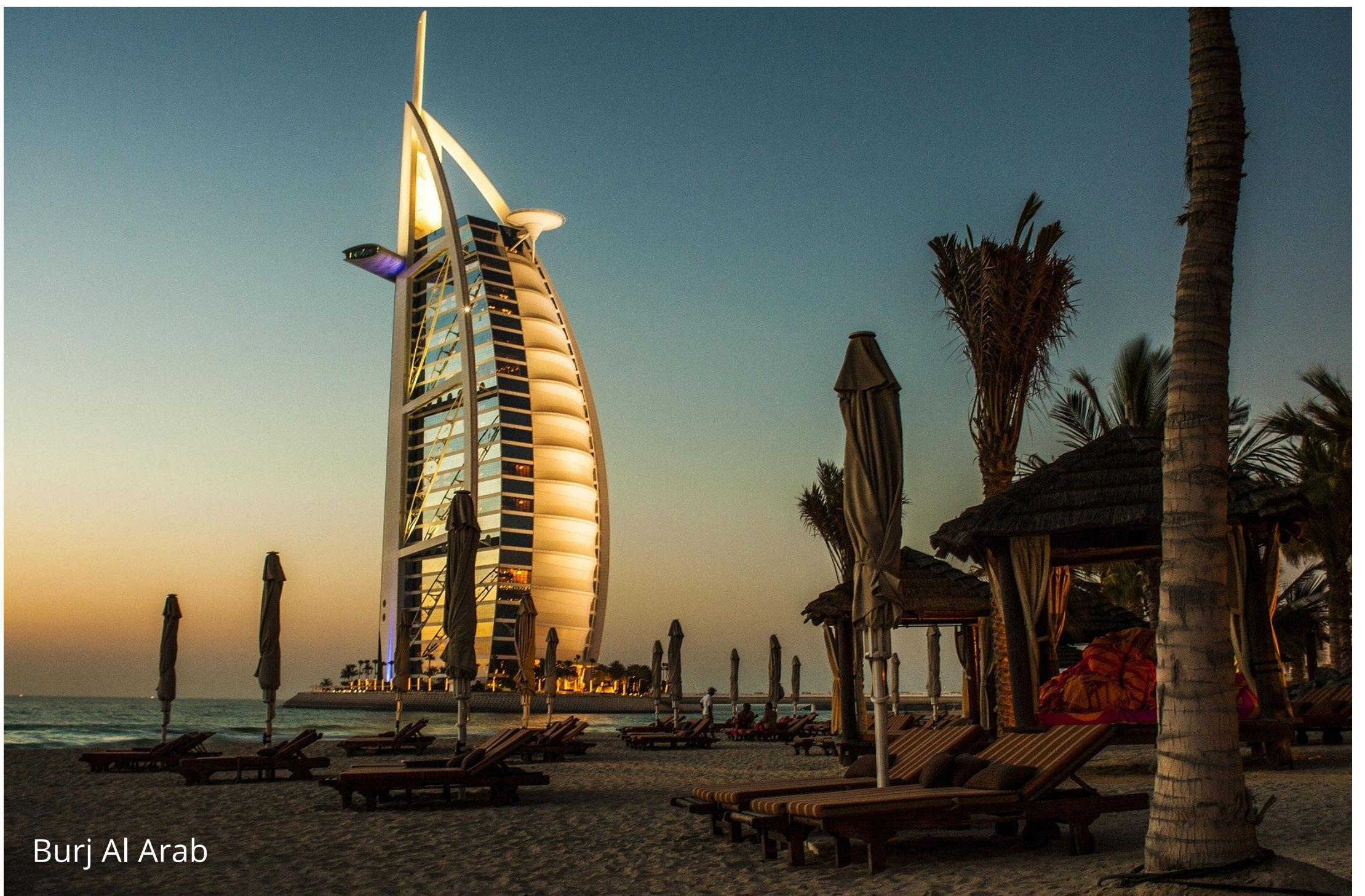
Burj Al Arab

Dubai is another requested destination for travel when we are safely able to do so. Where2Next? Travel, LLC will again offer the "Dubai Discovery" curated experience postponed by the pandemic. We are re-vetting our suppliers and will make any needed revisions to the original itinerary as necessary, especially in regard to post-pandemic protocols. Keep watch for a country write-up and small, private group itinerary in a future LUCULLAN issue.